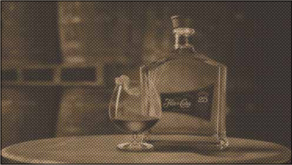
The Rum Rising from Nicaragua's Volcanic Ashes: Flor de Caña Centenario 25

This limited edition rum blend is available exclusively at The Walrus Club, and is showcased in the cocktail special aptly named 'Bundy Bearcat'. Give it a go!