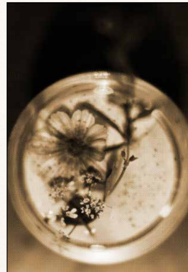
Our beautiful offspring, the Smooth Buttery Boy.