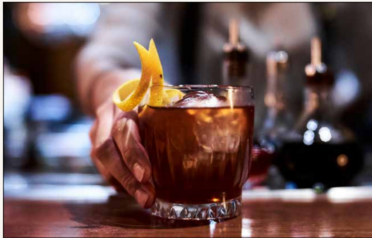
Our team of experienced bartenders are dedicated to their craft, expressing their passion with great skill and creativity.