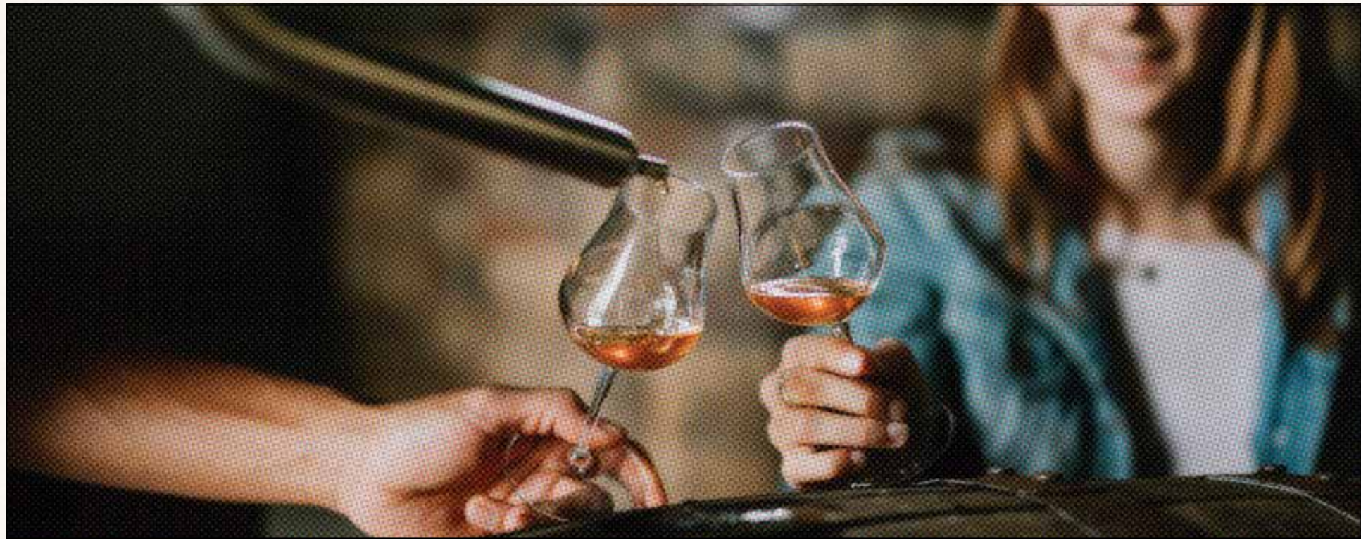
The ‘Husk’ team harvest, ferment and distil using sugarcane grown exclusively on their farm.

A quick perusal of our spirit shelves will provide an overview of the diversity of Rum / Rhum’s currently being produced across the world.